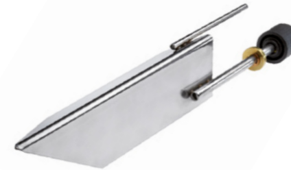
Replaceable stainless steel large area electrodes for different conductivities