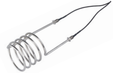
Resistor type heater elements in highly corrosion-resistant alloy