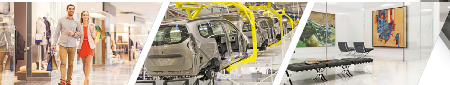
Shopping centre and department store